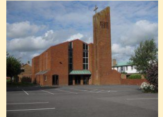
The Church of St David, Mold