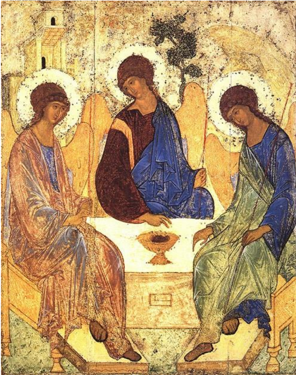
Andrei Rublev's icon of The Trinity or The Hospitality of Abraham (c.1411) Original in the Trinity Lavra of St Sergius, spiritual centre of the Russian Orthodox Church

Contact us at stbeunosoutreach@beunos.com