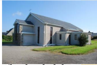
The Church of the Resurrection of the Saviour, Morfa Nefyn